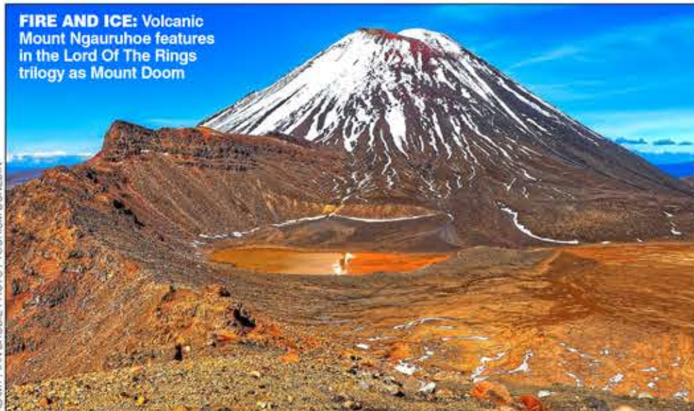
FIRE AND ICE: Volcanic Mount Ngauruhoe features in the Lord Of The Rings trilogy as Mount Doom